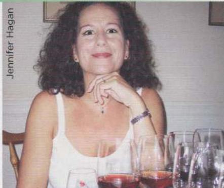
The Ladies Tasting Society and I wish you happy holidays.

M y family has always been extremely supportive of my being gay; most of you have probably noticed that my mother even shares top billing with me on Girlfriends' masthead. So going home for the holidays, for me, has never been awkward. In fact, mom and the rest of my clan usually have me so booked up during Christmas and New Year's that last year my wife and I ruffled some feathers when we announced that we were escaping to Mexico for a week in late December—and no one else was invited.